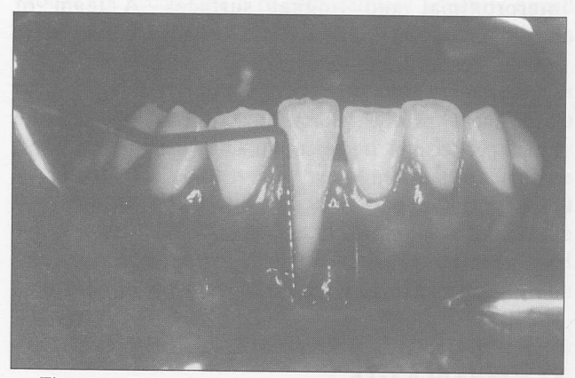
Figure 1. Frontal view: 10 mm recession on lower right central incisor.

On examination, she presented with problems of severe anterior open bite, increased in facial height and