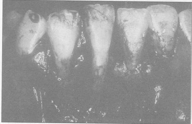
Figure 4. Perforation at the apical area of the lower right central incisor.

After a successful root canal treatment, a periodontal surgery was performed at the lower incisor region. When