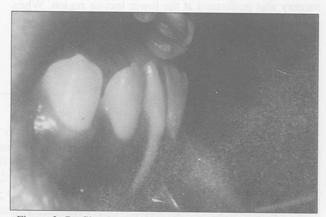
Figure 2. Profile view of the dehiscence affecting the lower right central incisor.