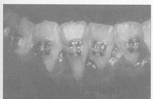
Figure 8. 2 years later. Dehiscence around the lower right central incisor was found to be stable at 50% of its original level.

The patient was reviewed at two and four weeks later where healing was uneventful. Two months later the dehiscence was reduced to 50% of its original value measuring 5-6mm from the amelocemental junction (Figure 7). Two years after the procedure, the oral hygiene had deterioted with plaque deposits around the brackets but the dehiscence appeared stable at 50% its original value with no pocketing on the labial surface of the tooth and the gingival tissue was strongly adherent to the underlying bone and the root of the tooth. The mobility of the tooth has greatly reduced.