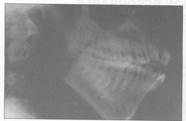
Figure 3. Lateral skull radiograph showing the lower right central incisor with no labial bony support.

tipping of upper right lateral incisor into the adjacent cleft region. In the lower arch, clinically she had proclined lower incisors with severe gingival dehiscence on the lower right central incisor with an exposure of 10 mm from the amelocemental junction (Figure 1 & 2) and a pocket at the apical region of the tooth which extended to the mucogingival junction. This was confirmed with lateral skull X-ray where the tooth had erupted labially with little labial bony support (Figure 3). Further examination revealed that the tooth was non-vital and pus exudated from the apical region when the surrounding soft tissue was palpated. The mobility of the tooth was found to be of Grade 2 with no pocketing on the interproximal and lingual surfaces. A team of Periodontist, Orthodontist and Prosthodontist came together for further assessment and management.