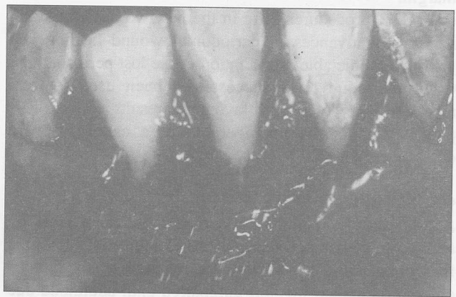
Figure 6. New immature connective tissue covering 75% of the original dehiscence.

After six weeks, a re-entry surgery was performed to remove the non-resorbable membrane. Underneath the