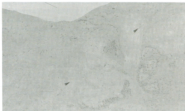
Figure 4. Section of a biopsy specimen not fixed in formalin for two days. Autolysis has taken place and most of the areas show an acellular appearance (arrows) due to widespread cellular degeneration. The difficulty in interpretation is obvious (H & E, magnification X 40)

When a biopsy specimen is removed, it should immediately be immersed in a fixative solution eg. 10% buffered formalin. Fixation is required to arrest autolysis and putrefaction and to stabilise the protein of the cells. The specimen should not be left on the counter top or tray where it will dehydrate and autolyse (Fig. 4). Ideally, the total volume of the fixing solution should be at least 20 times the size of the tissue specimen(7). There have been occasions where specimens arrive at the laboratory, sitting on the container wall way above the level of the formalin, occasionally bathed by the fixative during transit. These specimens are as bad as dried up ones.