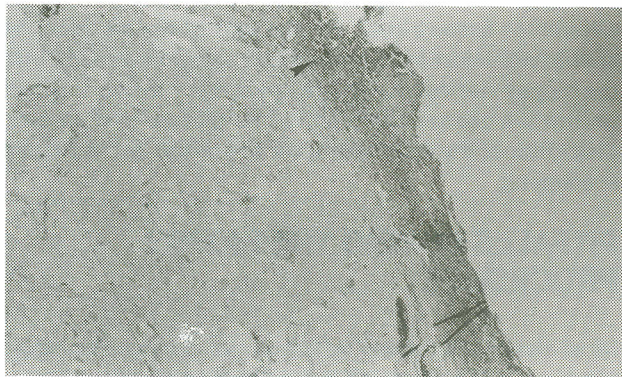
Figure 2. An incisional biopsy of a vesicullo-bullous lesion on the palate exhibiting only connective tissue. A moderate degree of inflammation is present within lamina propria (arrow). Interpretation is impossible without the overlying epithelium. (H & E, magnification X 40).

In vesicullo-bullous lesions, as early a lesion as possible should be taken for biopsy, preferably not older than 48 hours. After this period a significant amount of epithelial regeneration will have taken place at the floor of the blister which may dislocate the bulla from its primary site. With the exception of large bullous lesions, an excisional biopsy should be carried out including the edge of a new lesion extending into normal mucosa or skin. A biopsy taken at the edge of the ulcerated bulla may show only denuded epithelium (Fig. 2) so that even immunofluorescence may be useless.