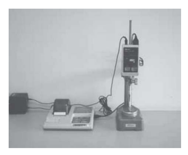
Figure 2: The Mitutoyo digimatic indicator.