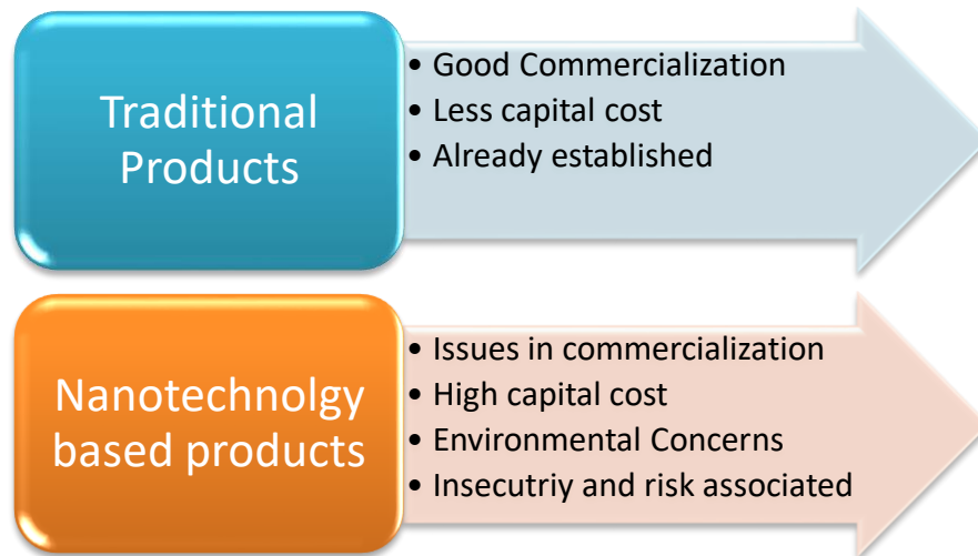
Figure 3: Difference between traditional and nanotechnology-based products concerning investor's perspectives

It has to be renowned that investors dislike most of the products related to nanotech-based on the myth rather than the truth (Kahan et al., 2009). Most of the marketers were waiting for the acceptance of the product in the market. On the other hand, good profits could achieve by a higher assessment