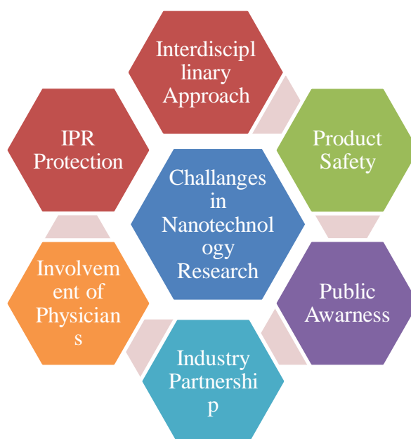
Figure 1: Challenges in Nanotechnology-based product commercialization

The long-term toxic effects of absorption of such nanoparticles have yet to be conclusively studied. The lack of safety and toxicity data regarding nanocosmetics has attracted the attention of social work groups worldwide. They are now raising their voice toward the adoption of a stringent regulatory guideline for nanotechnology-based cosmetics, as well (Raj et al., 2012). For the time being the guidelines for cosmetics were comparatively less rigorous including the absence of any requirement for the post-market surveillance. Challenges in Nanotechnology-based product commercialization as shown in Fig.1