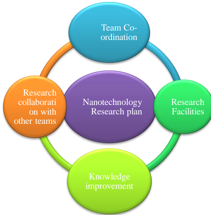
Figure 2: A framework for Nanotechnology Regulatory Research plan