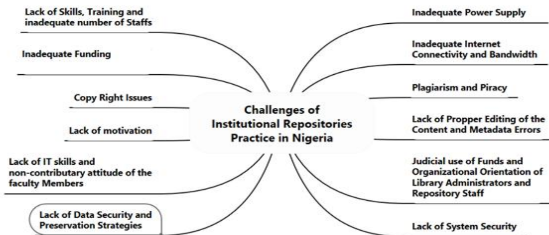
Figure 3: Challenges of IRs Management in Nigeria