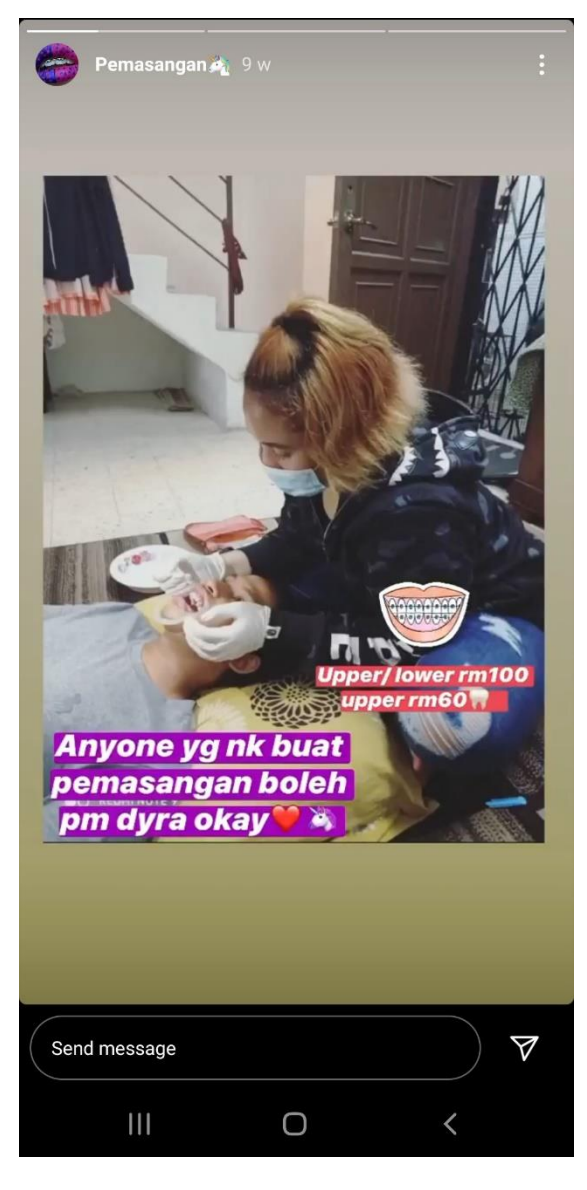
Figure 6 : An example of Instagram post about fake braces installation service at home (source: access from Instagram public account).

Figure 5 : a) An example of Instagram post about click braces with new account notification; b) An example of Instagram post about fake braces service operation hours (source: access from Instagram public account).