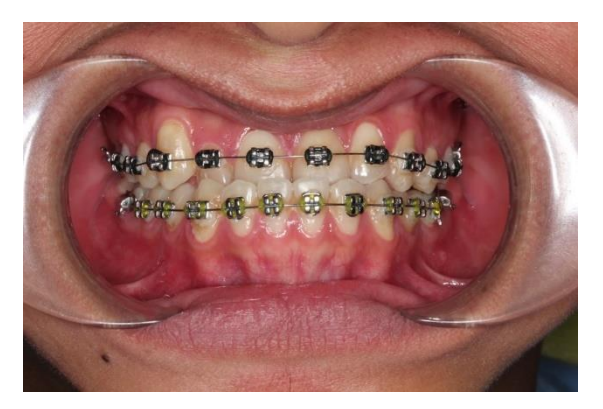
Figure 1: Fitted fake braces from left to right first molars but had inaccurate bracket positions.

The fake braces were often fitted from a premolar on one side to the contralateral premolar on the other side, however, some were fitted to extend up to the first permanent molars (Figure 1). Generally, fake braces were fitted without orthodontic/molar band (Figure 2). The brackets or tubes were usually not accurately positioned with majority being placed in the middle or upper third of the teeth, while the brackets positions on displaced teeth were adjusted such that all brackets are arranged in a straight line for easy engagement of the archwires (Figures 1 and 3). The clinical photos (Figures 1 to 3) were taken during personal encounter of fake braces cases by the authors at their practice. In some other cases, the braces had small dimensioned round archwires, which can be assumed were selected to facilitate easy engagement to the bracket slots. The archwires were held onto the brackets with elastomeric modules or powerchains in various colours. Other article has reported on the use of cyanoacrylate resin (plumbing adhesive) to fix the brackets onto the tooth surface [9].