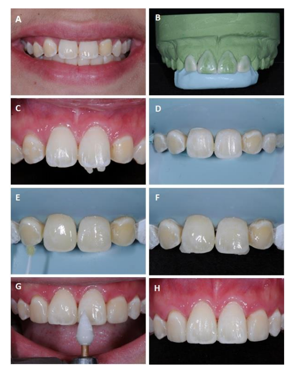
Figure 2. The treatment procedures are as following; (A) Smiling pre-operative view showed mismatch color of tooth 23 and multiple diastemas. (B) Diagnostic wax-up (C) Shade selection using composite button prior to rubber dam placement. (D) Multiple teeth isolation with rubber dam. (E) Teeth surfaces after etching and bonding. (F) Palatal shelves build up using the putty index. (G) Finishing and polishing. (H) Final result showing excellent soft tissue contours and color integration of the Ceram. X composite restoration.

6. Palatal composite shelves were formed using silicone key. Labial surfaces were sculpted using Ceram.X° one (A1). Same procedure was carried out on the remaining teeth (Figure 2F).