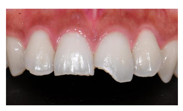
Figure 5. Retracted pre-operative intraoral view showed non-complicated crown fracture on tooth 11 and 21 and slightly rotated tooth 21.

fractured upper front teeth, as a result of a fall when he was 13-years old (Figure 5). He currently has an aesthetic concern over his fractured teeth leading to low self-esteem. He would like to improve the appearance of his upper anterior teeth which would then restore his confidence. Clinical examination showed both central incisors were fractured involving the incisal edges and incisal angles, the pulp was not involved on both teeth. Tooth 21 is mal-positioned mesiolabialy. Treatment plan: Restore fractured teeth and correct the alignment with direct composite restoration using Ceram.X° one.