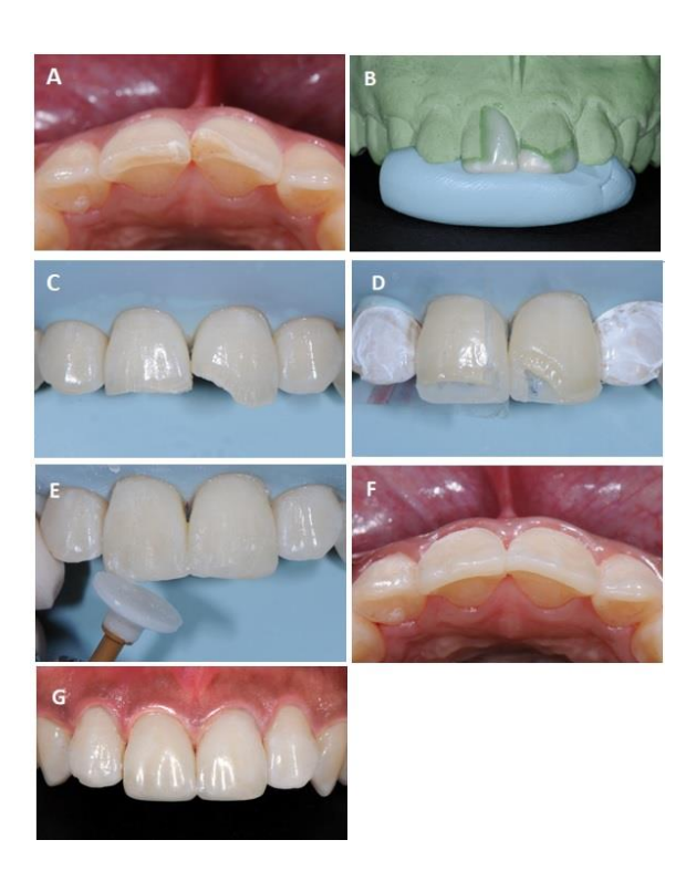
Figure 6. The treatment procedures for case 3 are as follows; A) Occlusal view showing the mildly rotated 21; B) Mock up and silicone putty index; C). Teeth preparation after bevel.; D) Palatal wall build-up and layering technique.; E) Finishing and polishing; F) Occlusal view; G) Final result