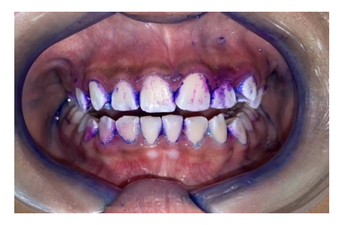
Figure 3: Frontal view of labial surfaces of anterior teeth coated with plaque disclosing dye.

Figure 2 : Intraoral images taken by E1 using a smartphone camera with auxiliary tools (cheek retractor and intraoral mirror). (a) upper occlusal; (b) right lateral; (c) frontal; (d) left lateral; (e) lower occlusal