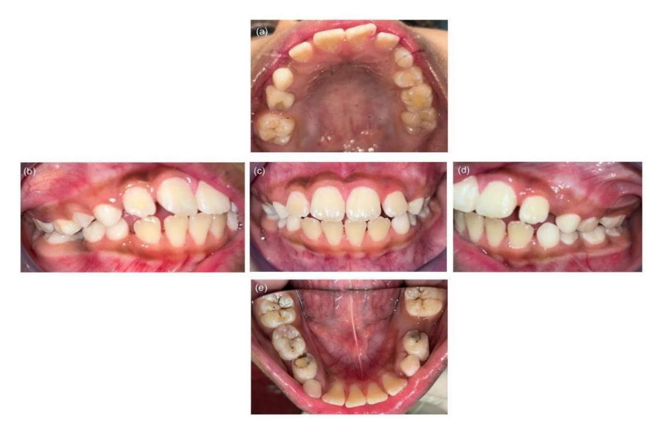
Figure 2 : Intraoral images taken by E1 using a smartphone camera with auxiliary tools (cheek retractor and intraoral mirror). (a) upper occlusal; (b) right lateral; (c) frontal; (d) left lateral; (e) lower occlusal