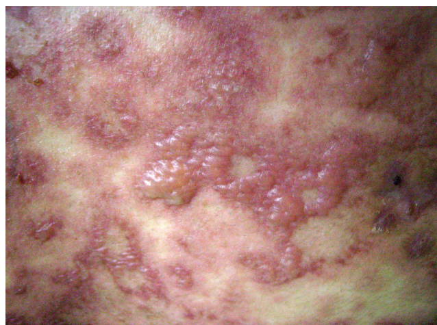
Figure 2b: Same patient showing superficial blisters appearing on the trunk