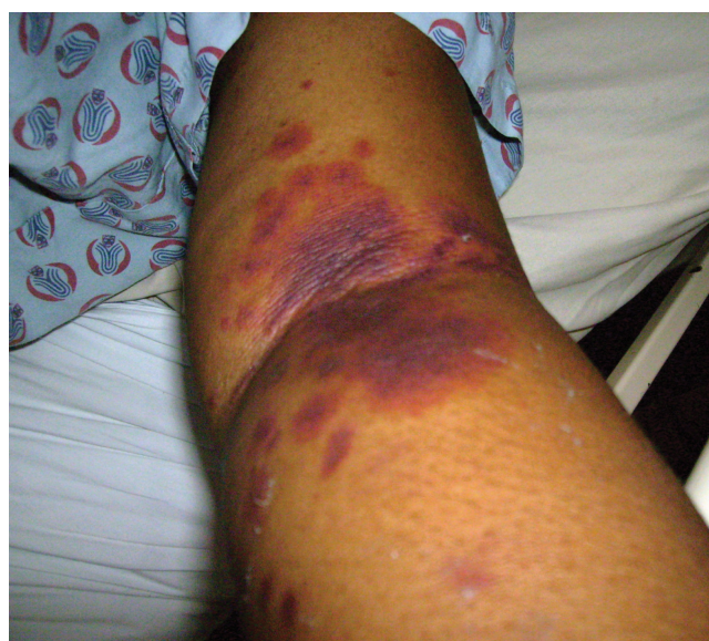
Figure 1a: 48-year-old female with Bullous Erythema Multiforme

On the fifth day of admission, she developed erythematous, target-like, blistering lesions on the dorsum of her right hand and on the antecubital fossa of her left arm (Figures 1a and 1b). These lesions appeared around the area of the branula site. The initial impression was that these lesions could have been caused by the extravasation of the antibiotics into the tissue around the branula. She gave no past history of adverse reactions to any medication. She was prescribed dilute potassium permanganate soaks to the areas of the blisters. One percent hydrocortisone cream was prescribed topically on the non blistered target lesions.