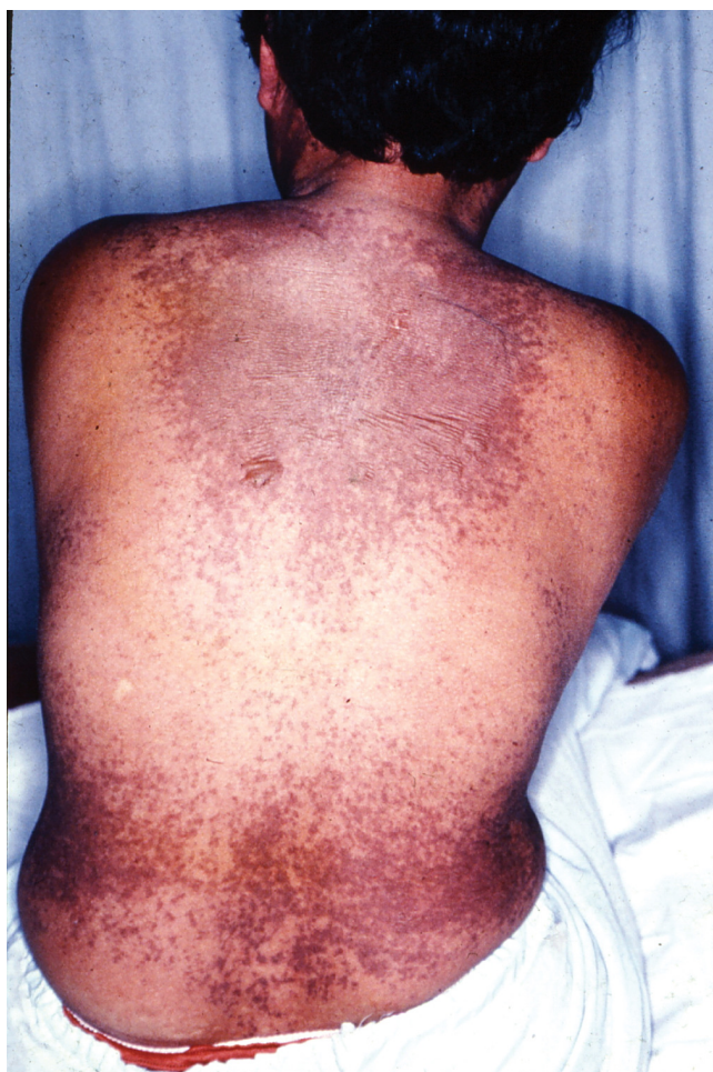
Figure 3: TEN- Slide of another patient with a similar condition

SJS and TEN are two related mucocutaneous reactions characterised by blistering lesions involving the epidermal region of the skin and erosions of the mucous membrane. The incidence are 1 to 6 and 0.4 to 1.2 per million person-years respectively (1, 5).