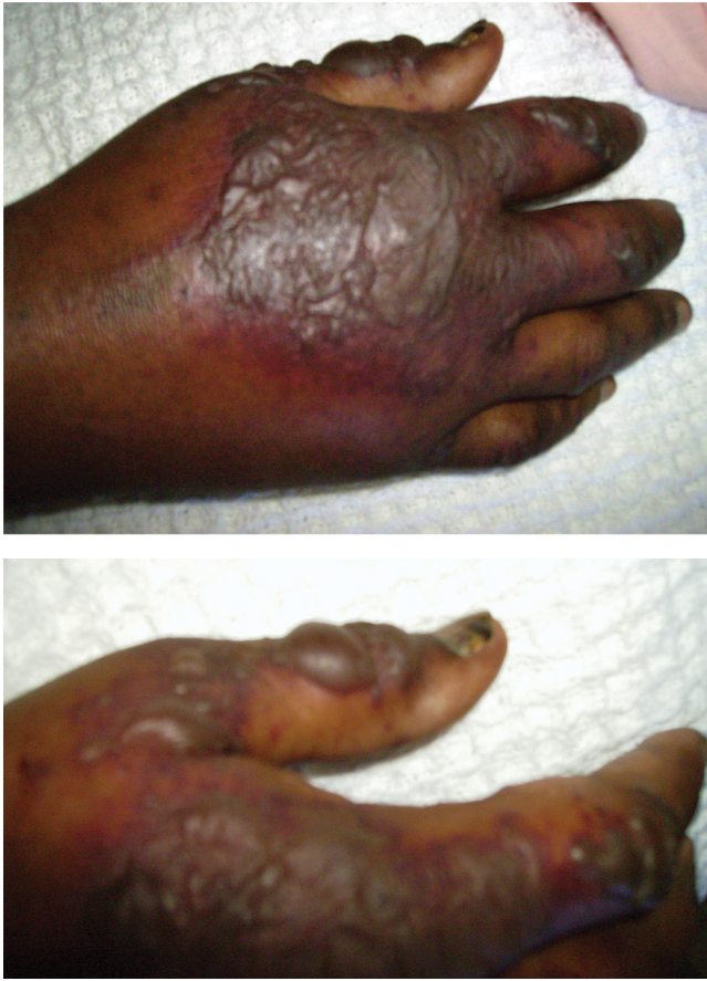
Figure 1b: Same patient showing bullous eruptions on the dorsum of the hand

Over the next two days, the lesions progressed, involving both limbs and the upper part of her trunk. She was then started on intravenous hydrocortisone. A diagnosis of bullous erythema multiforme secondary to ampicillin and sulbactam (Unasyn) was made.