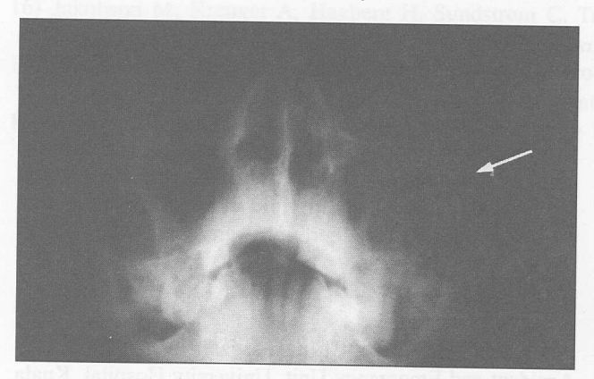
Figure 2. Occipitomental radiograph showing the left depressed zygomatico-orbital fracture.

Clinical examination of the maxillofacial region revealed a 5 mm laceration of the left frontal area, superficial facial abrasions, bilateral circumorbital ecchymosis and periorbital oedema (Fig. 1). There was subconjunctival haemorrhage but no light perception on the left eye. The left zygomatic bone was depressed. No nasal discharge or bleeding was observed and the maxilla was stable. The patient was able to open his mouth for about 2 cm interincisally and there was limitation of mandibular movement. Intraorally, the occlusion was