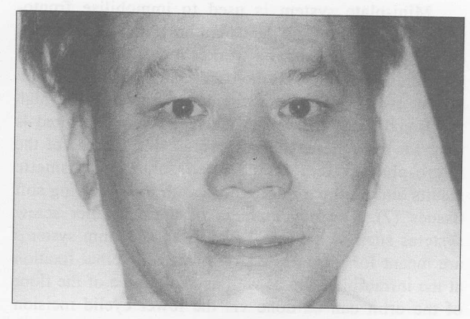
Figure 4. B. Postoperative appearance six weeks later