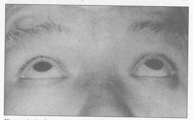
Figure 4. A. Scar appearance following the left lower eyelid or modified blepharoplasty incision.

The treatment plan was to elevate the left zygomatic complex via the Gillies' approach, exploration of the floor of the left orbit via the lower eyelid incision and fixation of the infraorbital rim. At operation, he underwent an open reduction to align the fractured zygomatic bone and fixation with the micro-platesystem at the infraorbital rim (Fig. 3). To achieve good cosmetic results the lower eyelid or blepharoplasty postorbicularis approach as described by Lacy and Pospisil (9) was performed. This consisted of a skin incision made about 2-3 mm below the grey line of the lower eyelid running parallel and along the whole length of margin. The extended lateral incision was delineated but not incised. The orbicularis muscle was divided below the incision line and the dissection was continued in a downward direction in the plane posterior to the orbicularis muscle but anterior to the orbital septum. The inferior orbital margin was exposed after incision of the periosteum, which was carried out a few millimetres below the orbital rim to permit good closure of the periorbita after bony repair. Medially, the periosteum was elevated with great care, to avoid damage to the inferior oblique muscle. The floor of the orbit was explored and found to be intact without entrapment of tissue, displacement or communication with