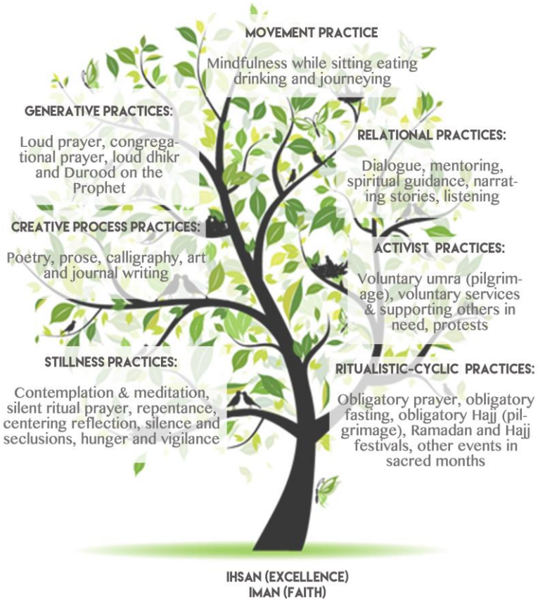
Figure 1: Islamic Contemplative Framework & Practices